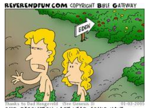
OUR RESOLUTION LAST YEAR COULD HAVE BEEN "LESS FRUIT", BUT NO ... WE WENT WITH "TRUST PEOPLE MORE"

Annual reports will be available to pick up during worship or from the church office by appointment. Annual Reports should be available by January 12<sup>th</sup>. You can also request a copy be emailed to you. Reports are due January 3, 2022.