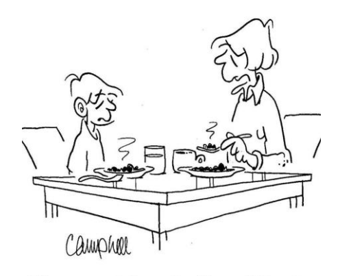
"These are vegetables, mother. You wouldn't want me to eat something I've given up for Lent, would you?"

The zoom link can be found at www.uplandbaptist.org.