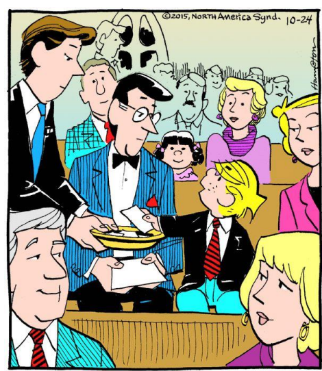
"CAN WE GET A REFUND IF THE SERMON ISN'T THAT GOOD?"

Good News! The Church lift is operational. We are pleased to be able to welcome all into the sanctuary once again.