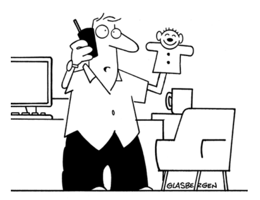
"No, I don't get lonely working from home. Not since I hired my assistant, Mr. Big Ears!"