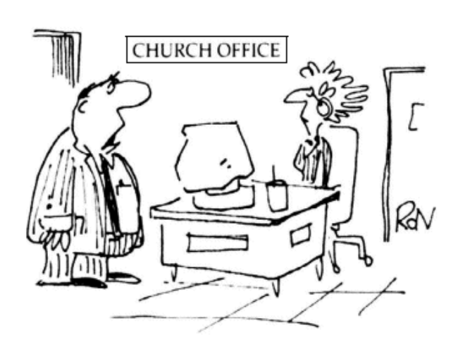
"If telemarketers call, invite them to church."

As you are aware, to volunteer in any capacity at the church, you need to have current child abuse and criminal clearances on file at the church. These clearances are valid for 5 years. Many of us in our church family have clearances expiring in November. If you have current clearances from another volunteer opportunity or a job, you can provide us with copies. Otherwise keep your eye out for more information about updating clearances in the near future.